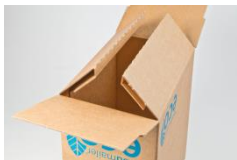
Special, insulating base construction