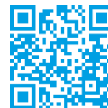
You can find assembly instructions here in the video.