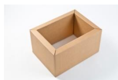
Patented, glued insulation ring