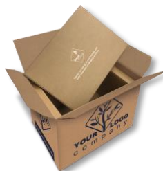
foodmailer® can also be printed individually