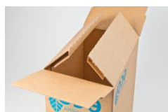
Special, insulating base construction