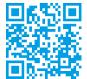
You can find assembly instructions here in the video.